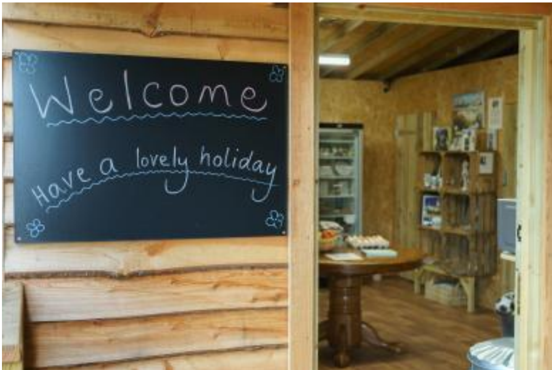
Honesty shop door

You can sit down inside the honesty shop/reception area.