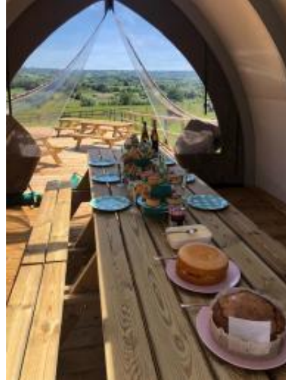
The hive communal area