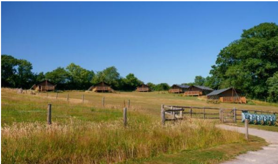
Lower Keats Glamping whole site

Contact for accessibility enquiries: Linda Kellaway