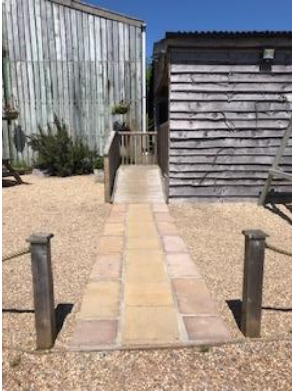
Honesty shop/Main entrance to welcome