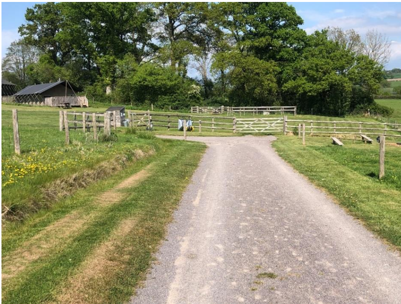
Access to Beer lodge via track for cars