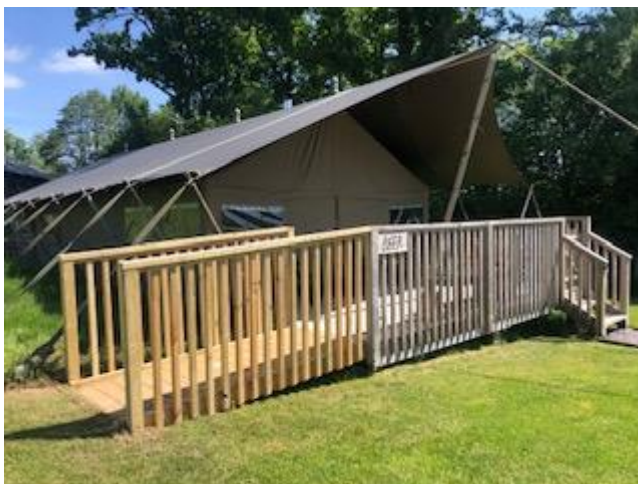
Front of Beer lodge with ramp