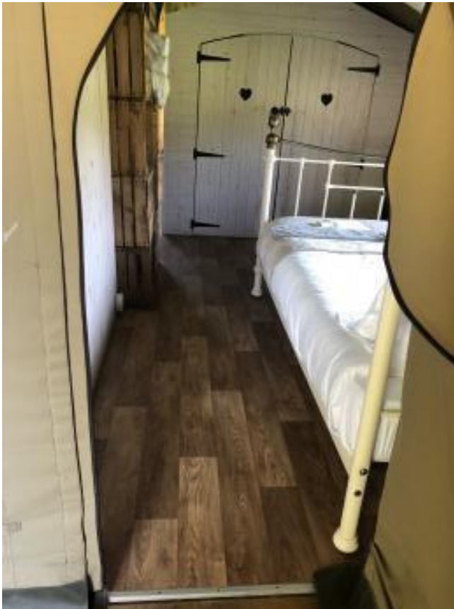
Rear tent door and fire escape access narrows to 690mm by end of bed