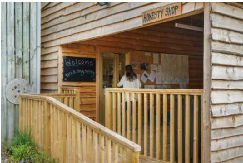
Honesty shop/Main entrance welcome area