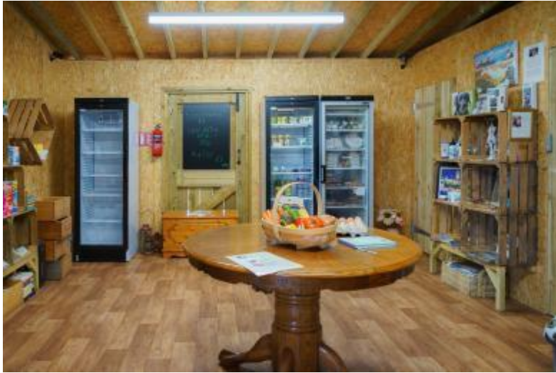
Honesty shop inside

You can sit down inside the honesty shop/reception area.