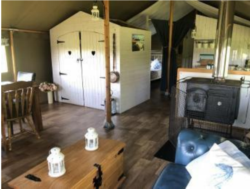
Open plan lounge