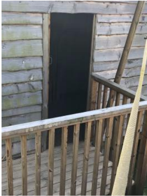
Rear tent solid door