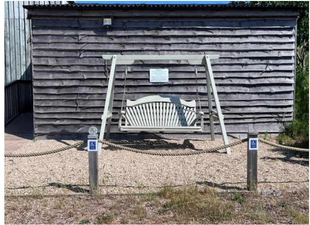
Disabled Parking Space