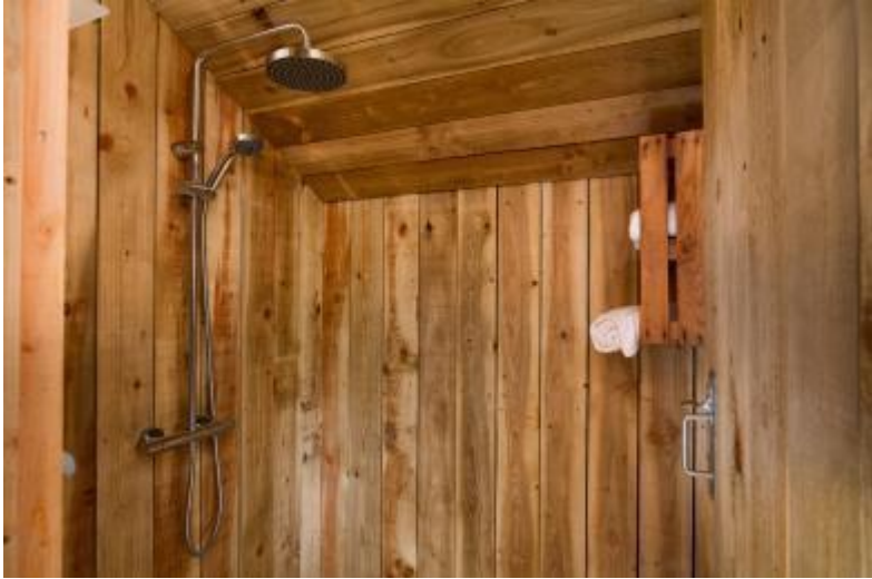
Shower room wet room