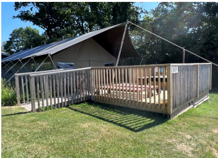
Front of Beer lodge with ramp