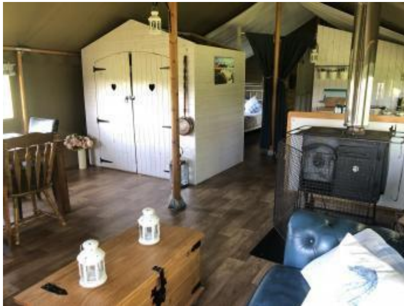
Open plan lounge