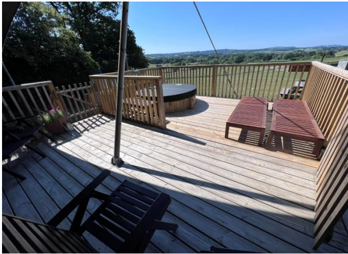
Beer front deck