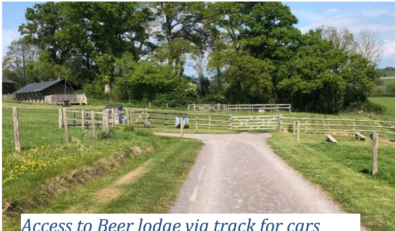
Access to Beer lodge via track for cars