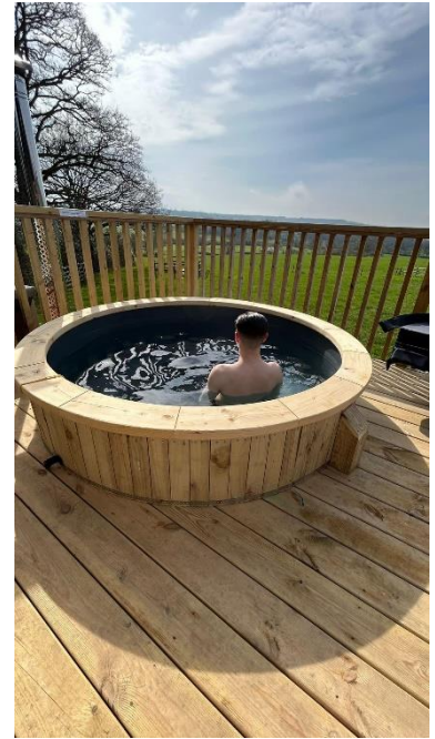
Wood-fired Sunken hot tub on Beer Lodge