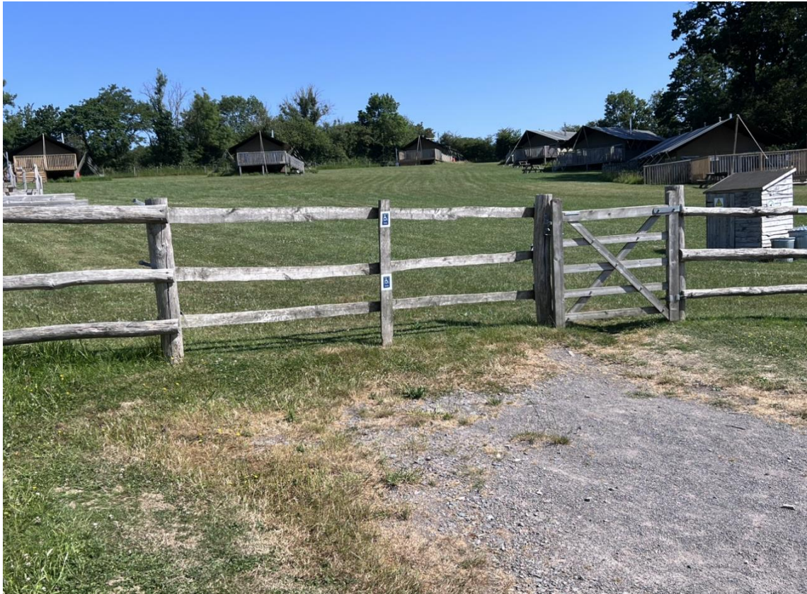
Disabled parking place