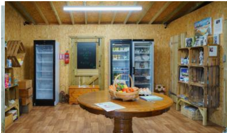
Honesty shop/Main entrance welcome area